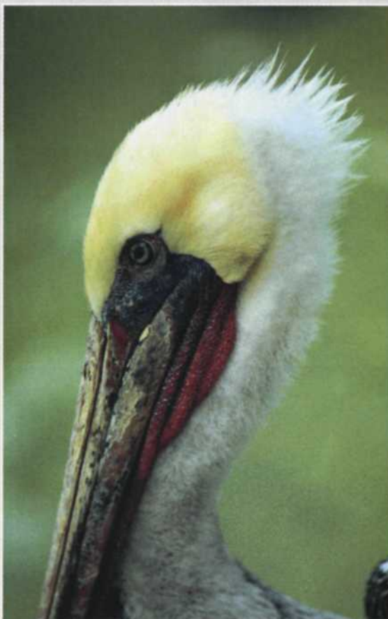
Far left: With a tripod and stationary subject, you can use slower films (ISO 125 here). Near left: A tripod will give sharper results with faster films (ISO 400 here), too, if the subject doesn't move.

But even the best of lenses will have trouble when the light level drops or the action increases. It's just a matter of photographic physics. You can minimize the movement with sturdy tripods and stabilization lenses, but eventually you will run out of f-stop and shutter-speed combinations needed to provide a sharp image. So what do you do then?