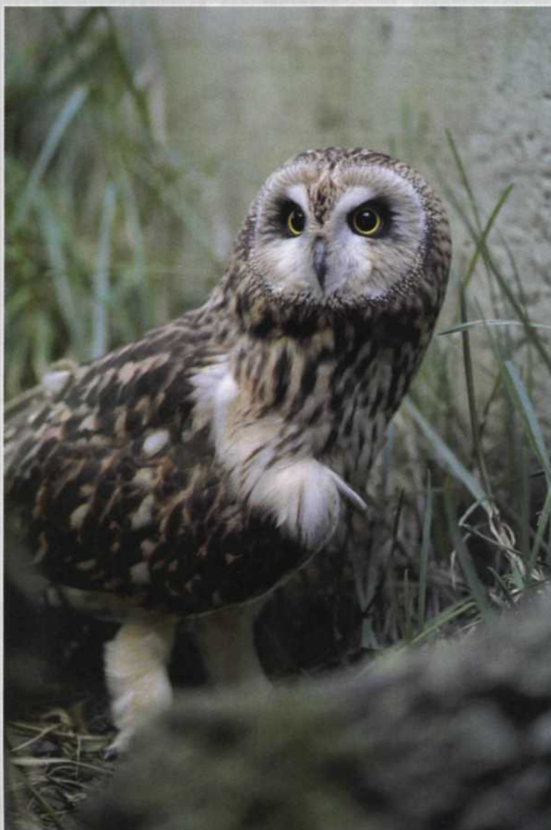
Here, Ektachrome 100 was pushed a stop to EI 200, for an exposure of \frac{1}{500} at f/5.6 with a 300mm lens indoors with overcast lighting.

How to get sharp shots when conditions conspire against you