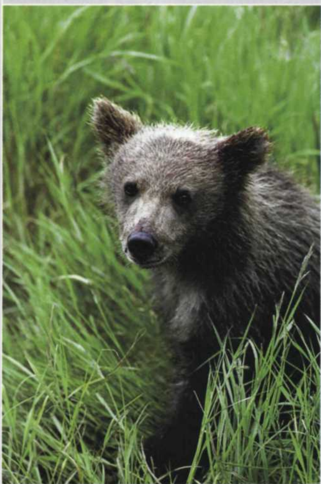
Above left: In good light, EI 320 was enough for this 300mm-lens shot.