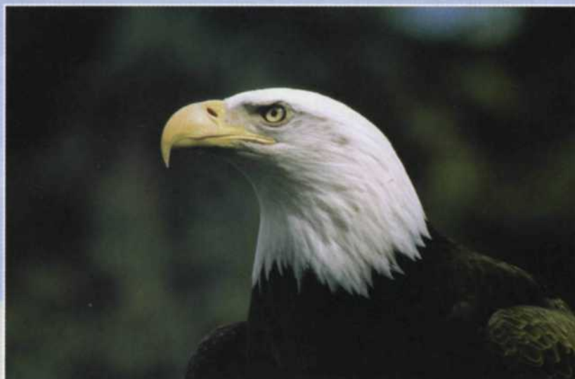
Above: A 500mm mirror lens, ISO 400 slide film, a stationary subject and a tripod produce great sharpness.