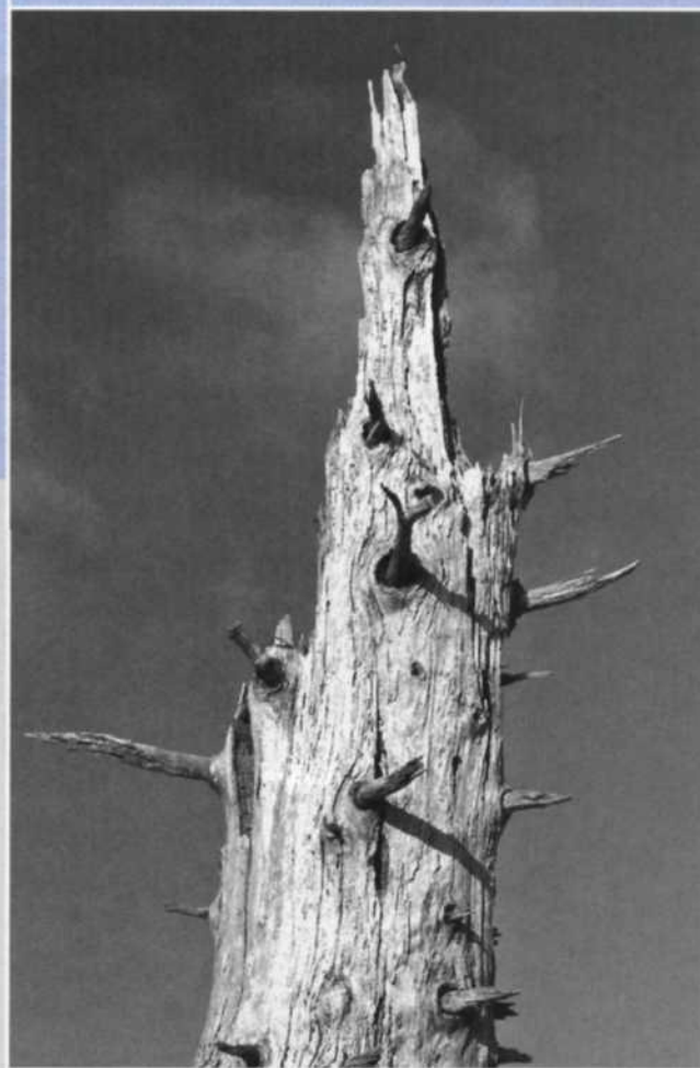
Both chromogenic (top left and bottom right) and conventional ISO 400 black-and-white films (top right and bottom left) work very well with hand-held 300mm lenses.